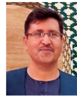
Dr. Abul Hassan Govt. Millat Graduate College Mumtazabad Multan