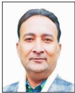
Dr. Sharafat Ali Graduate College Kot Sultan Punjab