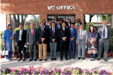
دالوں کے لیے اسے سودمند بنانے کا واحد طریقہ یہ ہے کہ نئے لکھاریوں کی حوصلہ افزائی کی جائے مجموعی طور پر یہ تقریب بہت خوشگوار رہی۔