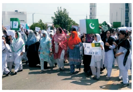
the people of occupied Kashmir.

administrative staff and President (CBS) led the walk with senior faculty members and students. The students raised slogans and sang national songs to show solidarity with