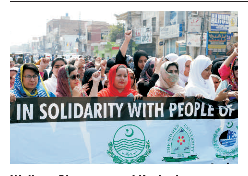
Walk on Observance of Kashmir Solidarity Day in Coordination with Local District Government Multan

People of Kashmir. The Department of History and Pakistan Studies & Department of MMG celebrated this day with full zeal and enthusiasm.